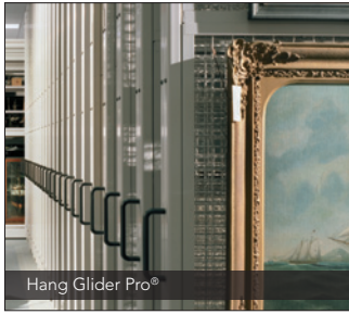
Hang Glider Pro®