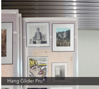
Hang Glider Pro®